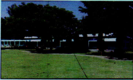
Administrative Building of the College