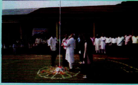
A Flag Hoisting Moment in the College with the President of G.B.