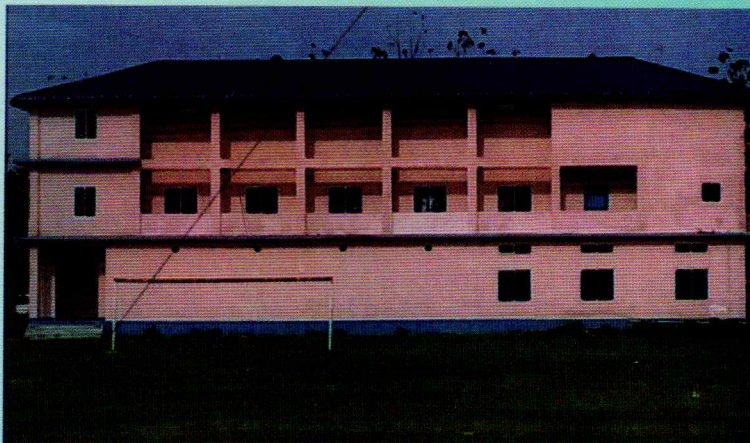
Multi-purpose Community Hall of the College