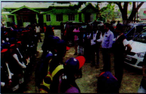
A Conversation of NSS Cadre of F.A. Ahmed College with C.O. Goroimari after Tukrapara village Adoption