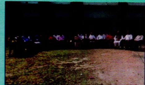
Teaching Staff of the College