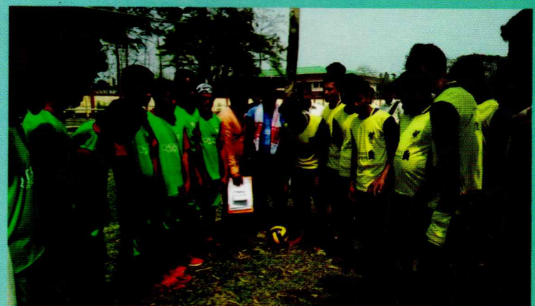
Inter-Class Football Match