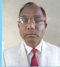
Hazrat Ali M.A