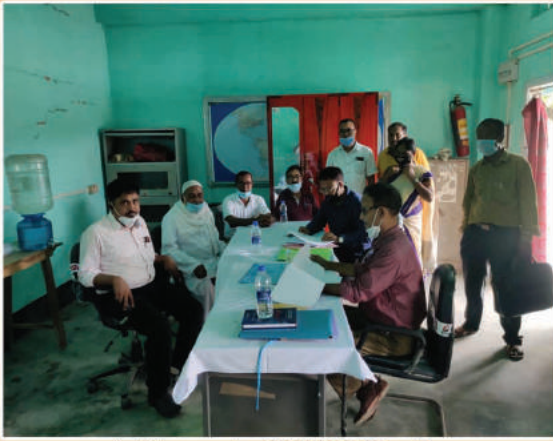
A Moment of DPC Meeting