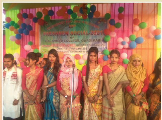
A Snap of Freshmen Social