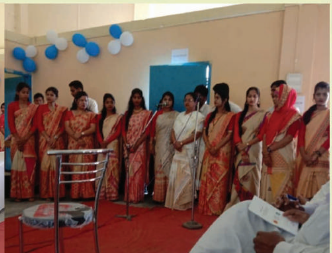
Chorus Moment in National Seminar