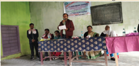
A Moment of Debate Competition