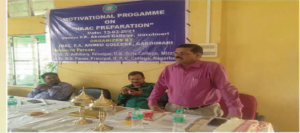
Motivation on NAAC A&A