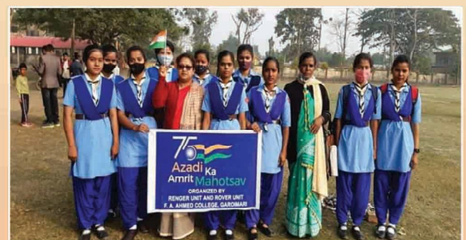
Programme of Scout and Guide