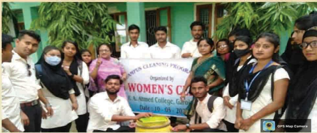
Programme of women Cell