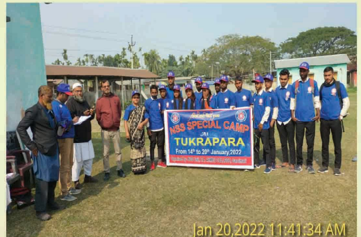
Programme of NSS