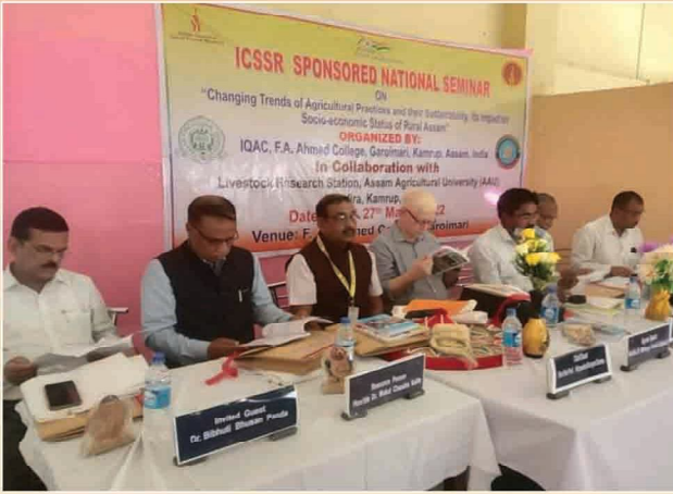
ICSSR National Seminar