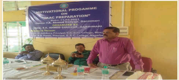
Motivation on NAAC A&A